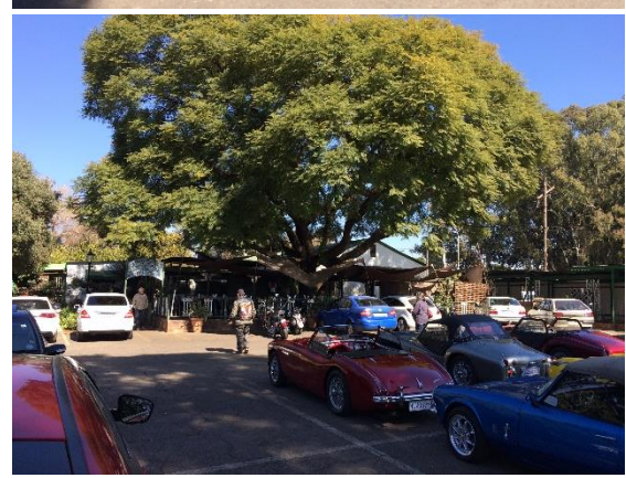
From the pictures archive Uncle Tim's Cabin, Benoni - June 2017