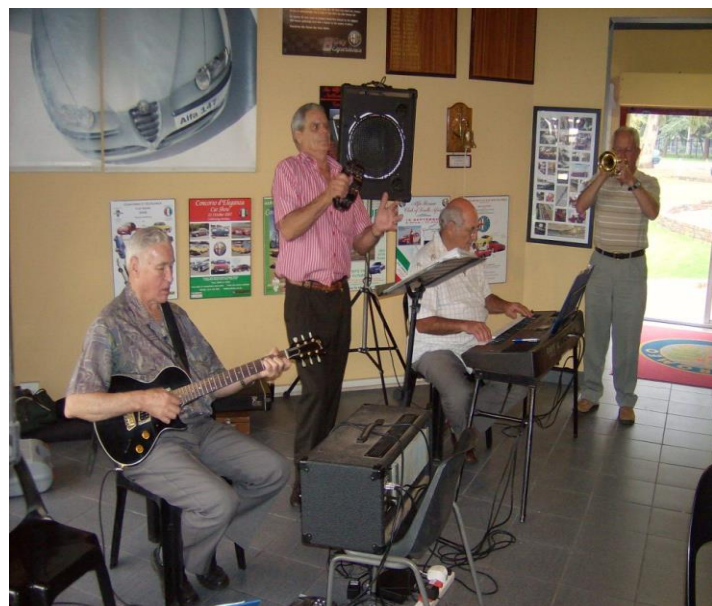
The Band in full swing