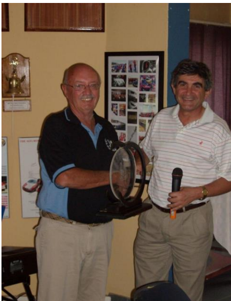
Chairman's Trophy Presentation

Overall I think that this was a fitting end to a jam packed year of activities. I think that the strategy of getting a number of different people involved in arranging outings has been a success and I am sure we all look forward to what is to come next year.