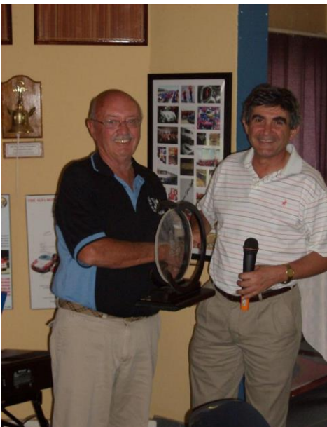
Chairman’s Trophy Presentation

Overall I think that this was a fitting end to a jam packed year of activities. I think that the strategy of getting a number of different people involved in arranging outings has been a success and I am sure we all look forward to what is to come next year.